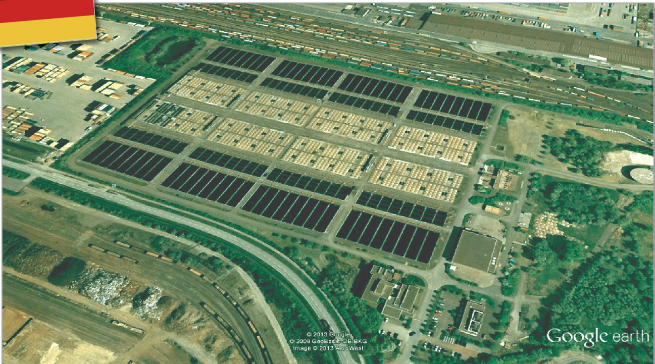
Aerial survey of WWTP Dradenau, part of Hamburg's central waste water treatment works Köhlbrandhöft/Dradenau

1988 Plant start-up 2,200,000 People Equivalent